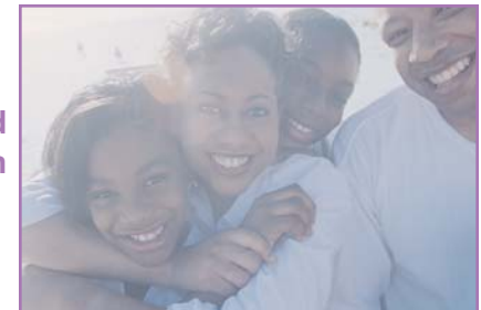
Family child interaction