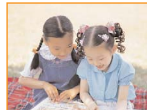
Libraries have free books for all ages