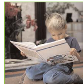
Libraries are FREE