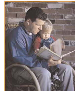
Home visits to promote language/literacy success