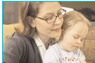
Drop in play and learn