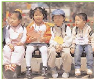
Multicultural Fun for Everyone