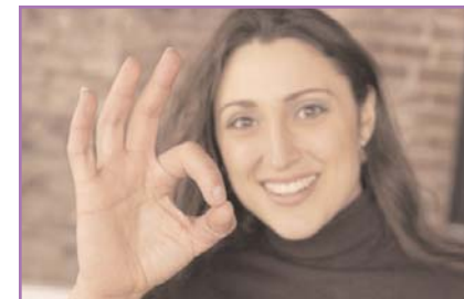
Information and educational services on “cued speech”