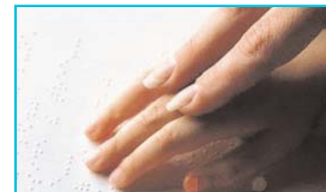
Services for the visually impaired