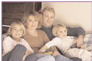
Learn good TV viewing habits