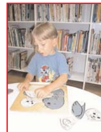
Drop in activities can put a smile on any child's face