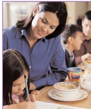
Reading with children